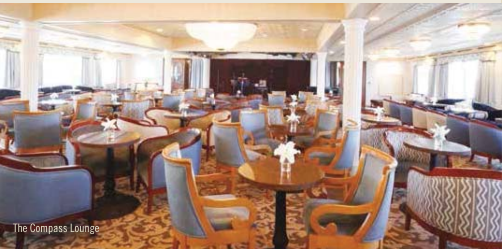
The Compass Lounge

Haimark Line, Ltd. may modify the cruise itinerary up to and during the voyage. All cruise accommodations and shore excursions are arranged by Haimark Line, Ltd., which may use other suppliers or providers to render services. The agreement in this brochure is the exclusive and entire statement of the agreement between you and Go Next, Inc. It should be read carefully.