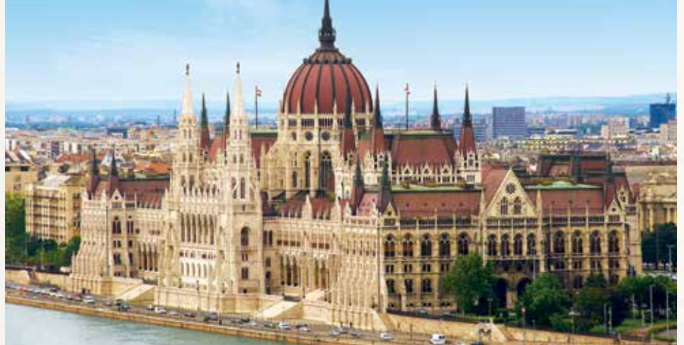
Budapest's majestic Parliament Building is a classic example of Gothic Revival architecture and a proud symbol of Hungary's national rebirth.

Travel Arrangements by: THOMAS P. GOHAGAN & COMPANY • 209 South LaSalle Street • Suite 500 Chicago, Illinois 60604-1446 • (800) 922-3088