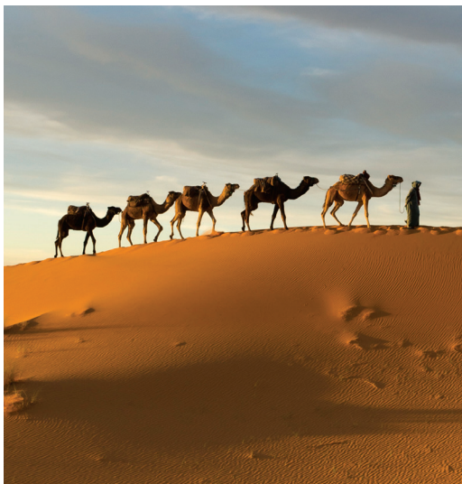
We ride camels in the Sahara on Day 8.

Day 13: Marrakech/Casablanca We leave Marrakech this morning by coach for Casablanca, Morocco’s largest