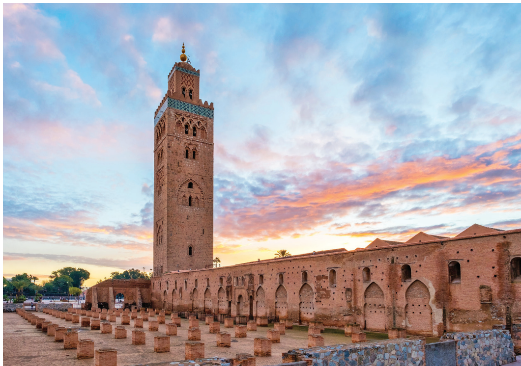
We see the distinctive Koutoubia Mosque – Marrakech’s largest – on Day 11.

Then it’s off to the traditional quarter to watch artisans craft the acclaimed Fez pottery and ceramics. The afternoon is free for independent exploration. B,D